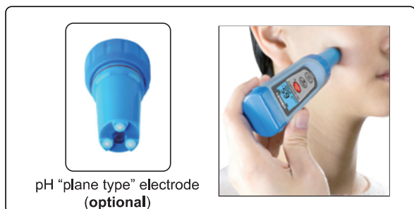
pH "plane type" electrode (optional)