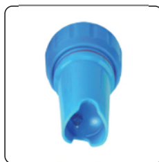
ORP "platinum needle" electrode(optional)