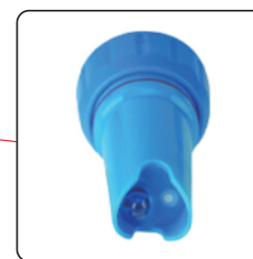
pH "bulb type" electrode (included)